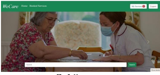
Fig 3. Home page

The system maintains an easy to use design which helps the user in all features of the system. Essentials like registration, login, and choosing services are designed in a way that they can be used comfortably by users of all ages, even the old ones. Encouraging retention and happiness in the users is aided by the simple design and clear arrangement of the screens used.